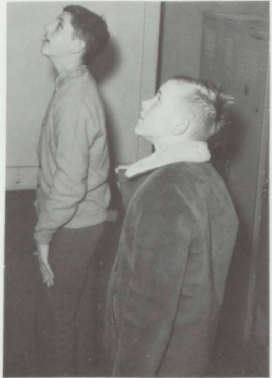
Look at those legs!