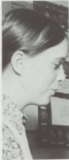
Kiss Me Quick!